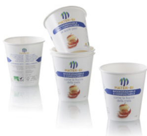
Laminated paper cups