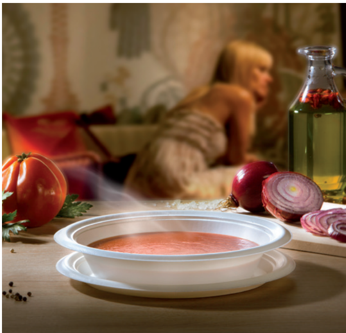
Plates for cold and hot dishes