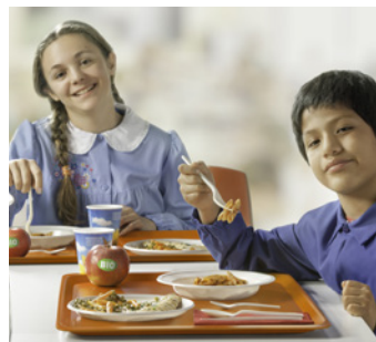
Complete set for foodservice