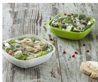
Thermoformed plates and containers for foodservice